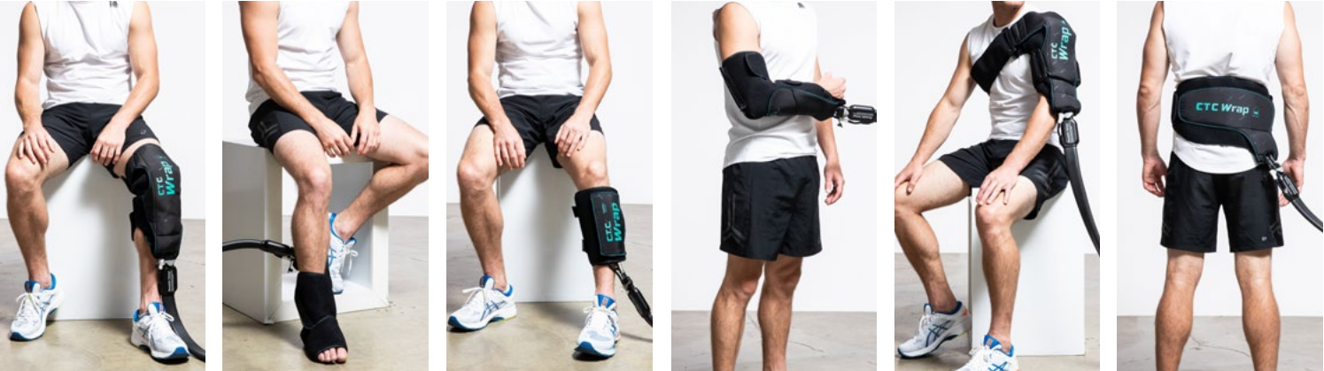
CTCAF00 Knee CTCUM00 Ankle CTCKF00 Universal Med. / Lg. CTCEF00 Elbow CTCSM00 Shoulder CTCEF00 Lumbar / Back