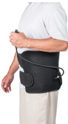
Pneumatic Hip Wrap OFHW-720