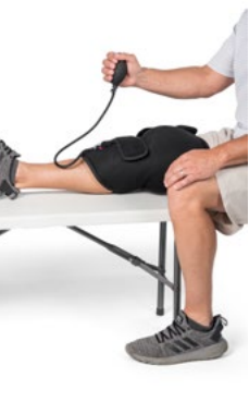
Pneumatic Knee Wrap OFKW-1000 (Large)

*For Convenience, purchase and keep additional Gel Packs in the freezer to be ready for use when needed. Gel packs can be heated in microwave for heat therapy. Refer to instructions for use.