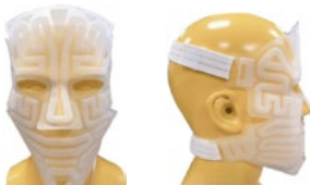
Full Facial TPC-22