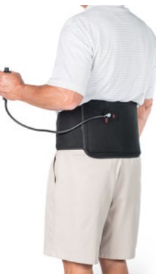
Pneumatic Lumbar/Back Wrap OFBW-520