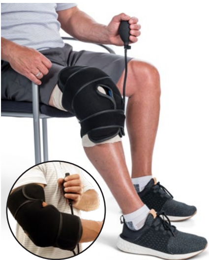
Pneumatic Knee/Elbow Wrap OFKW-510 (Medium)

Provides Stability. Promotes Alignment. Helps Improve ROM.