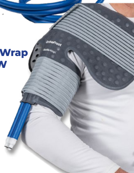
Cold Shoulder Wrap OFCTU-SW