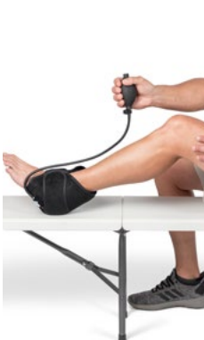
Pneumatic Ankle Wrap OFAW-480