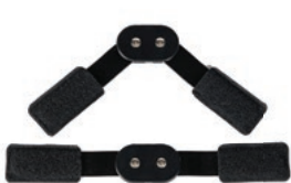
Polycentric Hinge OFKW-PL