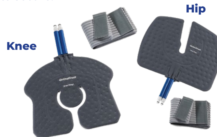
Ice Bags (Reusable)

Wrap Options: Knee, Shoulder, Hip, Back, Ankle, Elbow, Universal Wraps include elastic straps and are easy to secure.