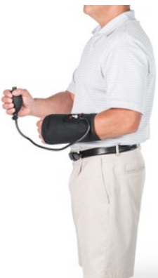
Pneumatic Wrist Wrap OFWW-300