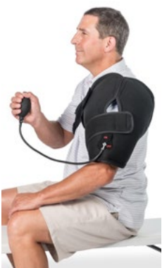
Pneumatic Shoulder Wrap OFSW-1002 (Large)