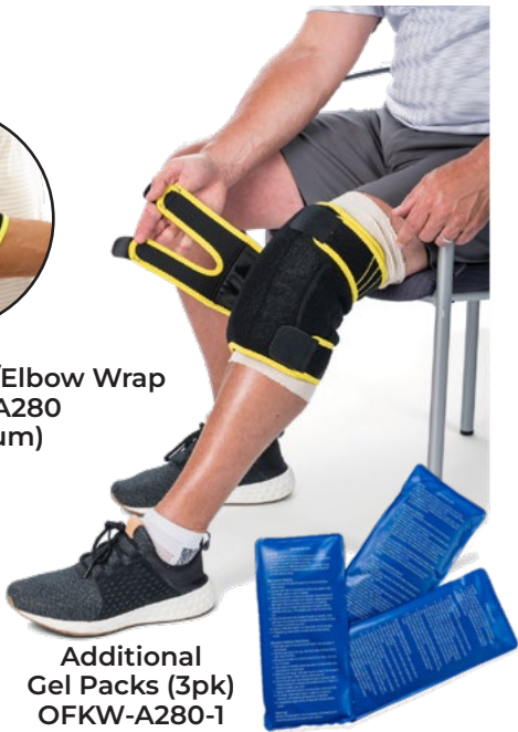
Additional Gel Packs (3pk) OFKW-A280-1