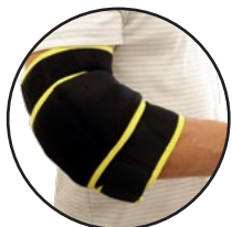
Dynamic Knee/Elbow Wrap OFKW-A280 (Medium)

* For Convenience, purchase and keep additional Gel Packs in the freezer to be ready for use when needed.