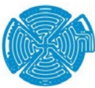
Round (Breast) TPC-15