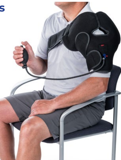
Pneumatic Shoulder Wrap OFSW-650 (Medium)

Includes: Wrap, Gel Pack, Hose & Compression Bulb Instructions for use/warnings