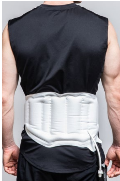
CTCEFD0 Lumbar / Back