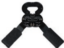
ROM Hinge OFKW-ROM