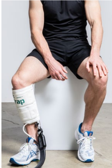
CTCUMD0 / CTCULD0 Universal Medium / Large