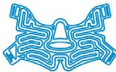
Bilateral Face TPC-21