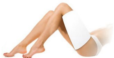
Large Surface TPC-20