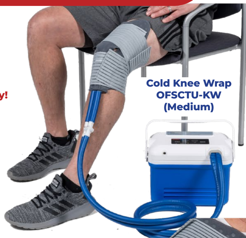
Cold Knee Wrap OFCTU-KW (Medium)

Indications: Pain and soft tissue swelling (edema) as a result of surgery, trauma or injury. For medical (Rx) use only. Intended to be used by or on the order of a healthcare professional. Proper use requires a skin barrier for cold wrap to prohibit skin/soft tissue damage. Read and understand all instructions and warnings listed in device Operation Manual before use.